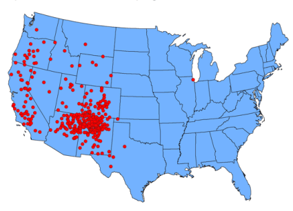
1 dot placed in county of exposure for each plague case

Reported cases of human plague--United States, 1970-2012